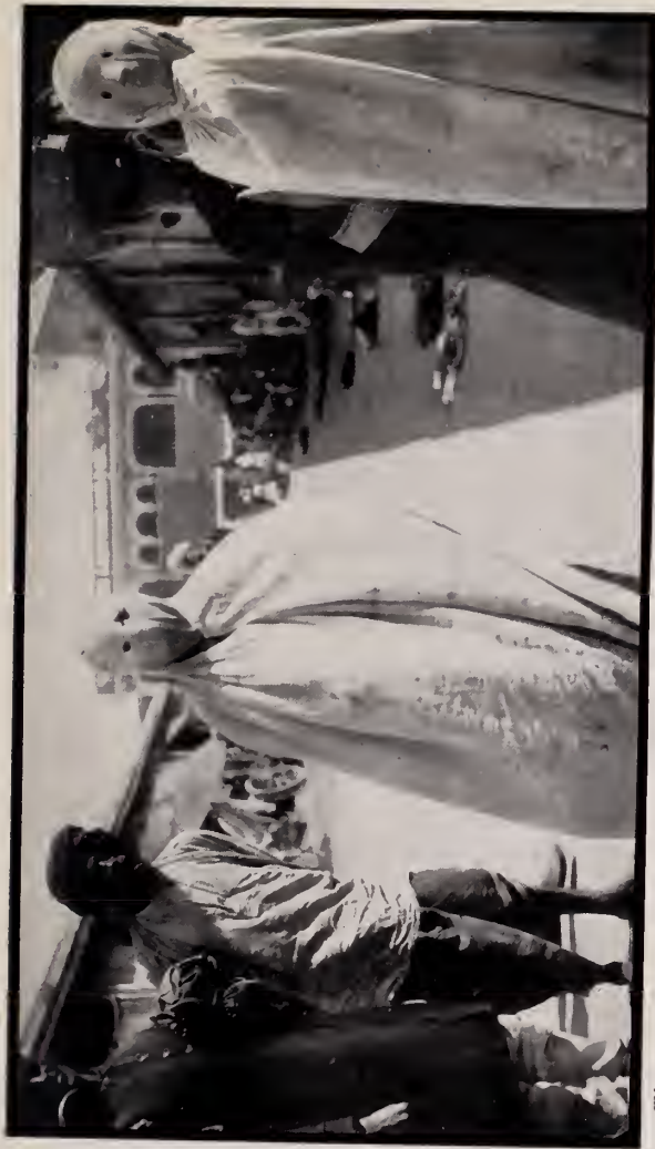
These are not members of the Klu-Klux Klan, as might easily be supposed, but Mohammedan women veiled from inquisitive eyes